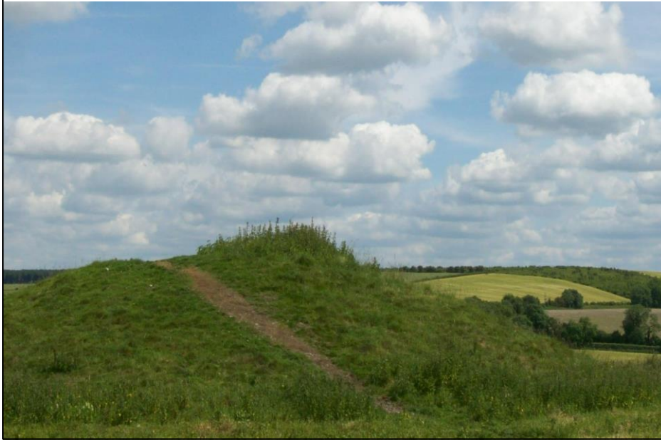
Bronze Age Burial Site