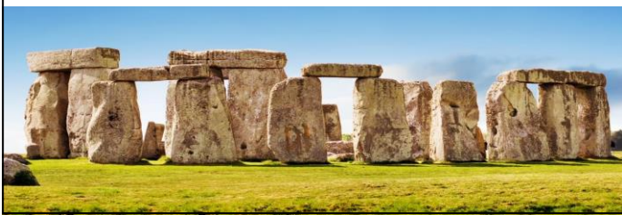
The Amesbury Archer Was Found Near Stonehenge